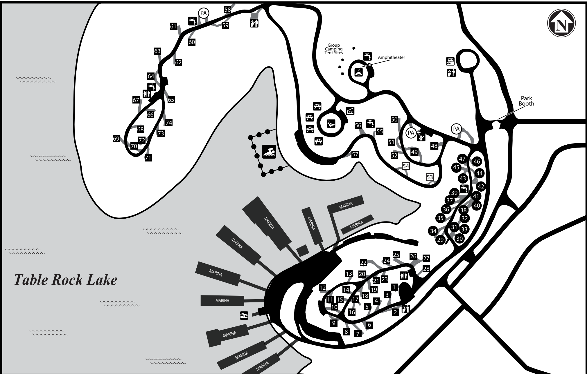
Table Rock Lake