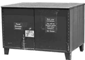
Food storage locker 3' x 4' x 3'

Help protect wildlife, including black bears, by properly storing your food at all times. Improperly stored or unattended food items will result in a violation notice. “Food items” include food, drinks, toiletries, cosmetics, pet food and bowls, and odoriferous attractants.